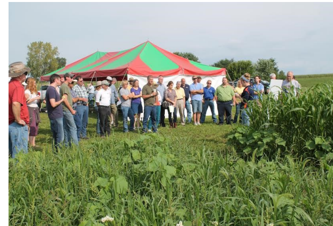
ISA PrairieEarth Farms Cover Crop Field Day

Your guide to businesses that supply seed and services to establish and manage cover crops in Illinois