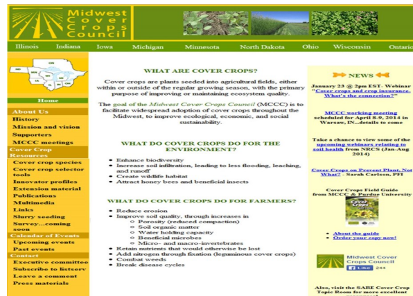
Midwest Cover Crop Council Website: www.mccc.msu.edu