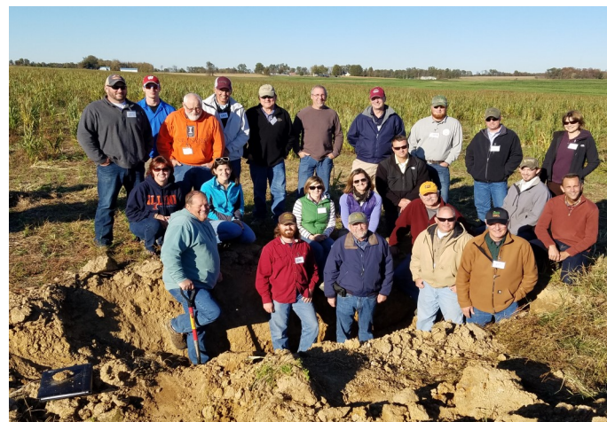
2017 SARE Soil Health Trainers