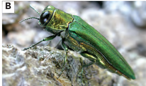
Michigan State University