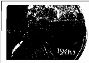
Emerald Ash Borer