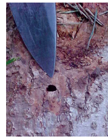
Emergence hole Shown actual size of 1/8" and D-shaped

The most visible sign of infestation is crown dieback. Branches at the top of the crown will die and more branches will die in subsequent years. As the tree declines, 'suckers', or new young branches, will sprout from the base of the tree and on the trunk. The bark may also split vertically and woodpeckers may feed on the beetle leaving visible damage on the bark. Successful treatments with insecticides are limited but continue to be studied. All ash trees near any new infestation will most likely become infested and die.