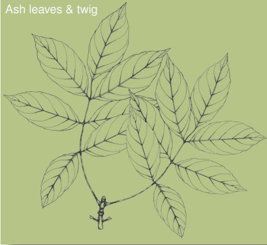
Ash leaves & twig

Ash trees are very common in landscapes and most species, mainly white ash ( Fraxinus Americana ) and green ash ( F. Pennsylvanica ) are native to Illinois forests. It is estimated that as much as 20 percent of street trees in the greater Chicagoland area are ash.