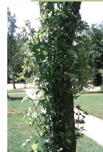
Suckers on trunk or base of tree